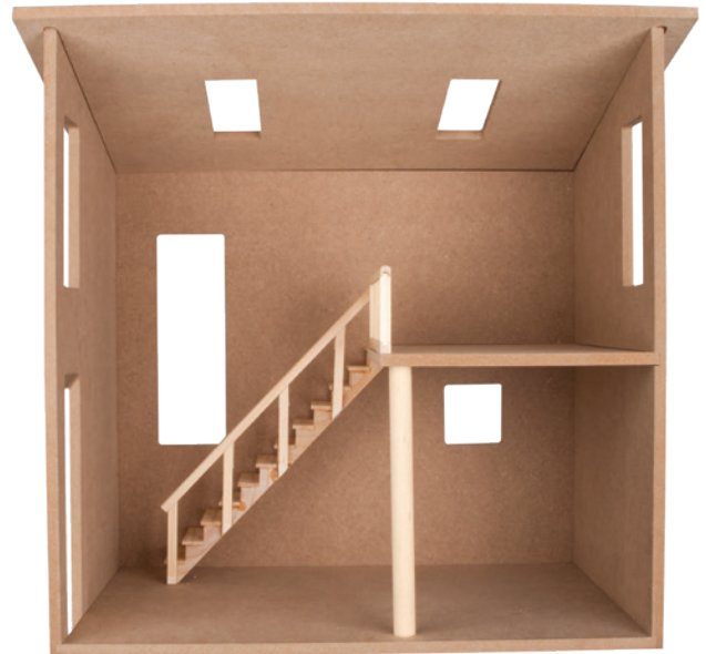
#92012 MiniTown Loft Kit with #92013 Component Set